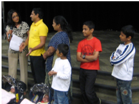
Our Sri Lankan family at the AGM

The Sri Lankan family talked about the conditions that caused them to flee to Canada. Having lived through civil war, with bomb and gun shot wounds to prove it, provided a sobering picture of what the family had experienced. They gave us a snapshot of the conditions on the cargo boat that was used for the journey to Canada. Limited food and water rations and one bathroom for all 400+ people on board painted a picture of a gruelling voyage. Ongoing medical appointments are now part of their way of life here in Canada.